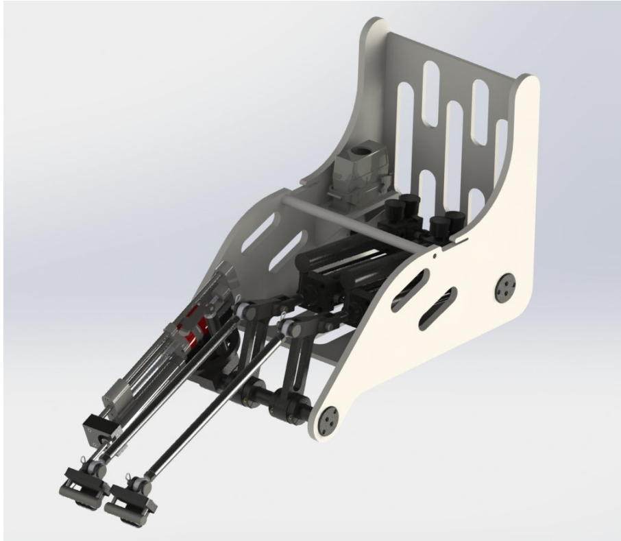
Fig.: Example picture of Robot