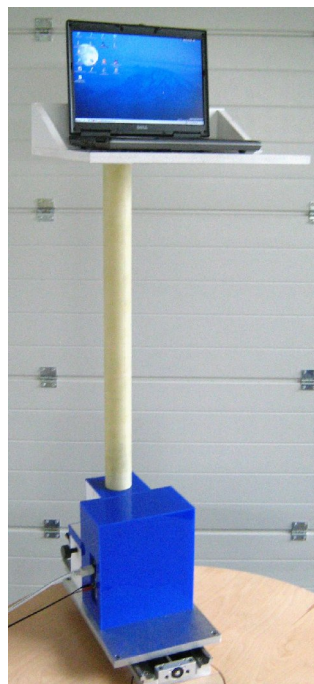
Fig.: Opt. Mounting Plate for Laptops

Information presented enclosed is subject to change as product enhancements are made regularly. Pictures included are for illustration purposes only and do not represent all possible configurations.