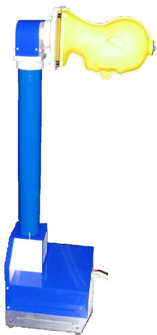
Fig.: Mounted Phantom head