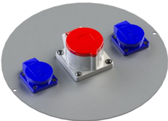
Standard center plate