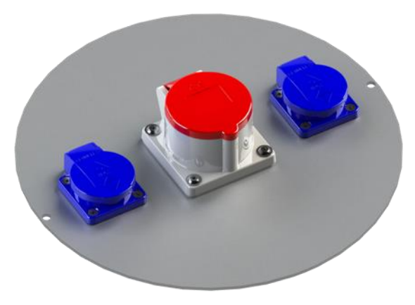
Standard center plate