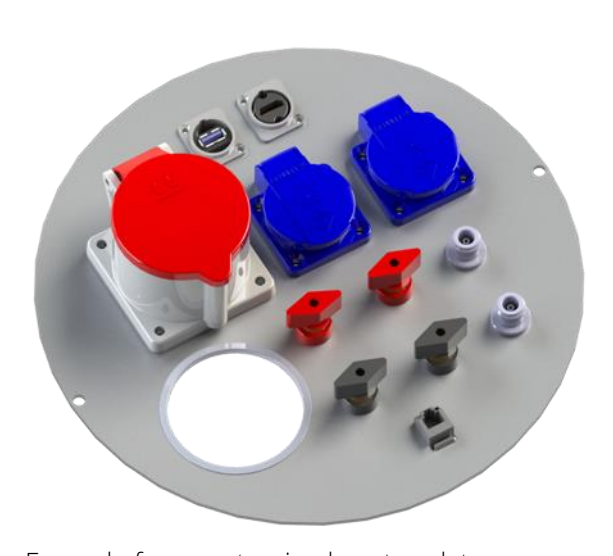
Example for a customized center plate

Information presented enclosed is subject to change as product enhancements are made regularly. Pictures included are for illustration purposes only and do not represent all possible configurations.